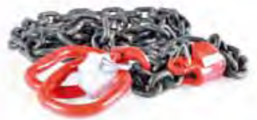
ADJUSTABLE CHAIN ADJ-CH-t-I Available SWL up to 3,5t for use in universal size systems