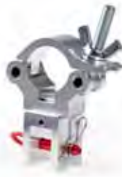
CELL 201 - DROPNET dropnet lock