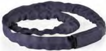
STEEL FLEX STE-F-USEFUL-I Black roundsling with galvanized aircraft cable on the inside. Increases safety. • higher heat resistance • no backup rigging required • conforms load to grip easily