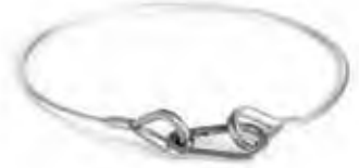
SECONDARY SAFETY CAR-WIR-t-I Available diameters: 2mm (0.08") 3mm (0.12") SWL 60-100 kg (132-220 lbs)