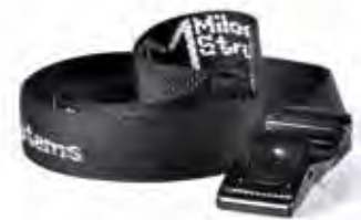
TENSIONING MILOS STRAP MIL-STR 25 mm x 1300 mm (1" x 51.2")