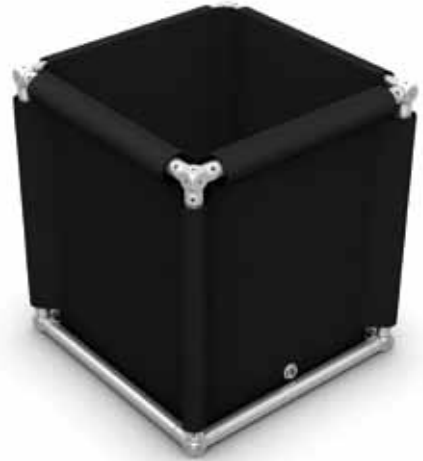
WT1 BS - WATER TANK WT1 BS • 800 x 800 x 900 mm (2.62' x 2.62' x 2.95') • provides 550kg ballast • can be piled-up two on each other using reinforcing stacking kit