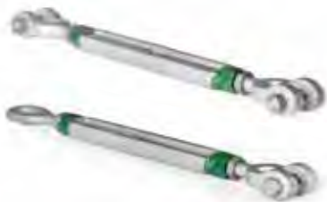
TURNBUCKLES TUR-d-ending / ending For tensioning wires. Available lengths: • 229 mm / 9" (fork/fork or fork/eye) • 304,8 mm / 12" (fork/eye)