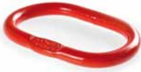
O-RING O-RING-t Available for SWL up to 6t (13227 lbs)