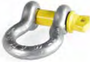
SHACKLE SHA-t Available for SWL up to 6.5t (14330 lbs)